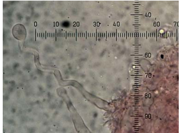
Hemimycena tortuosa cap cystidia at x 1000 under the compound microscope