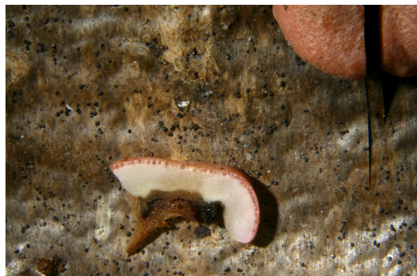
Hypocrea minutispora crosssection of the cushion showing the chambers near the surface where ascospores are released when mature