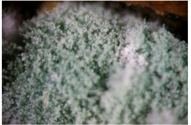
Hypocrea minutispora Trichoderm stage