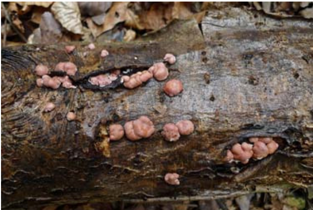
Hypocrea minutispora on (possibly) Aspen. Hypocrea minutispora (the scale divisions are 1mm)