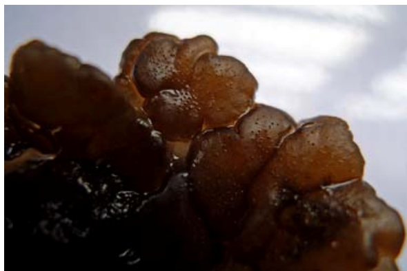
Exidia plana – now known as Exidia nigrescens