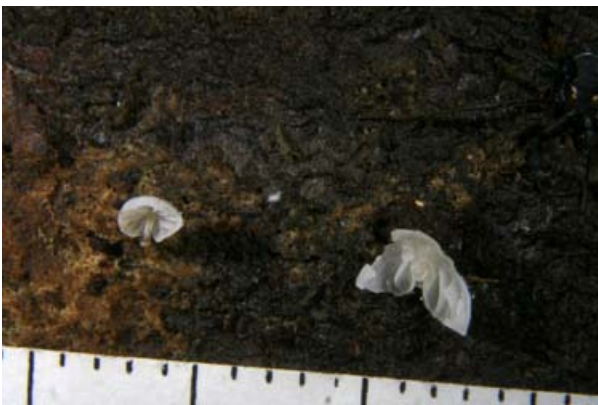
Hemimycena tortuosa (scale divisions 1mm)