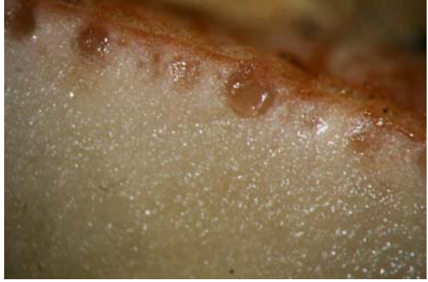
Hypocrea minutispora crosssection of the cushion