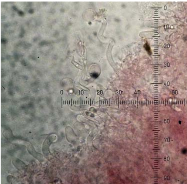
Hemimycena tortuosa cap cystidia at x 1000 under the compound microscope