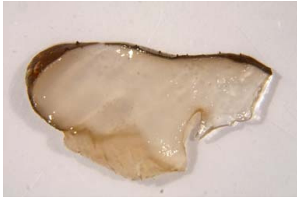
Exidia plana crossection