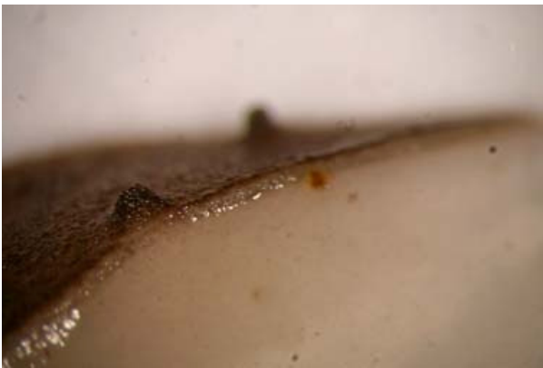
Exidia plana crossection