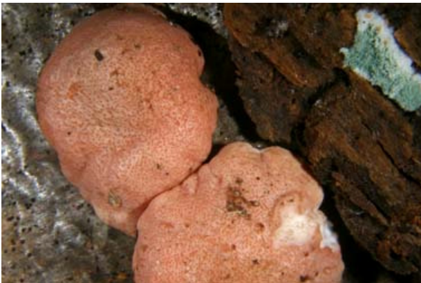
Hypocrea minutispora pink mounds (cushions) of the telemorph along with anamorph Trichoderma stage