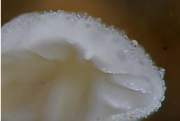
Hemimycena tortuosa (if you look closely, the corkscrew – shaped cystidia can just be made out on the cap surface)