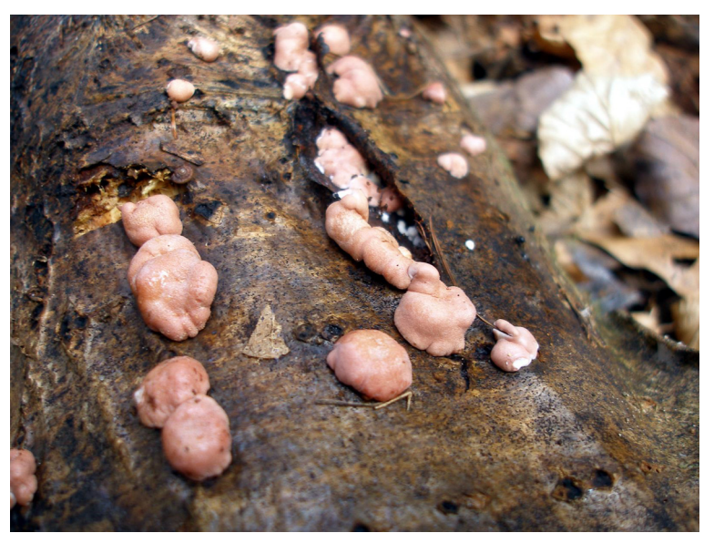
Hypocrea minutispora on the bark of a fallen Rowan branch at Hockeridge Wood 11.03.12.

See the complete list of species for more details.