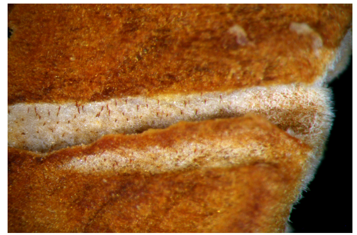
Phellinus ferreus, showing an individual chamber with setae now more obvious.