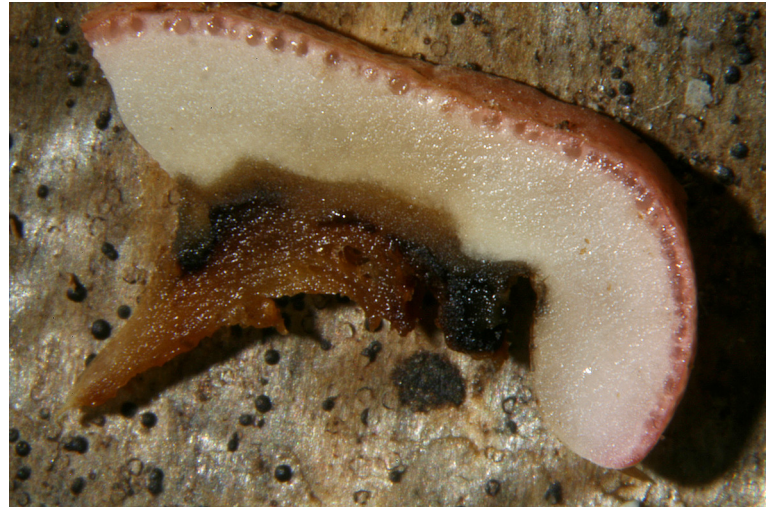
Hypocrea minutispora, a cross section showing the round chambers just beneath the surface from which the spores are ejected.