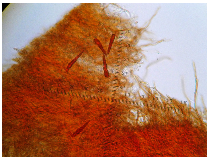
Phellinus ferreus, a microscopic view of the setae to be found only in the hymenial tissue of this species.