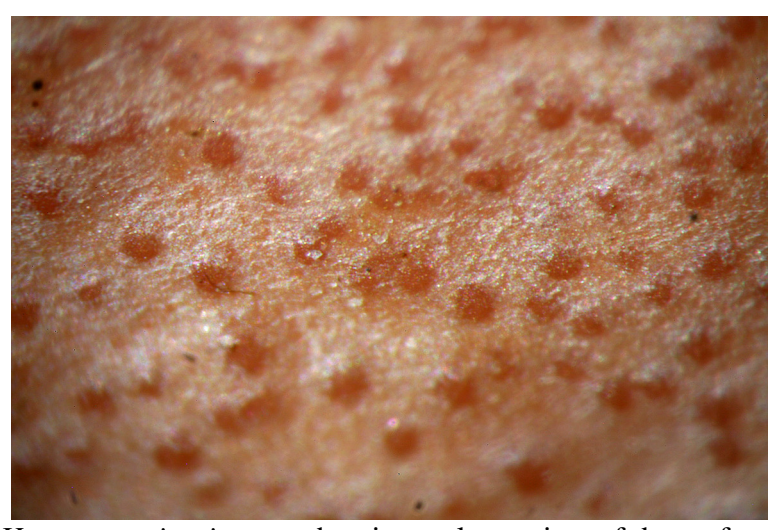
Hypocrea minutispora, showing a closer view of the surface.