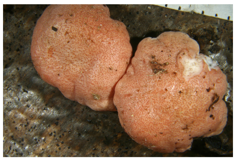
Hypocrea minutispora, showing the 'pock-marked' surface typical of the genus.