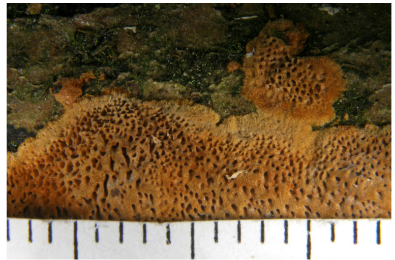
Phellinus ferreus from Hockeridge Wood, 03.03.13, showing a close-up of the pore surface. (The scales shows millimetres.)