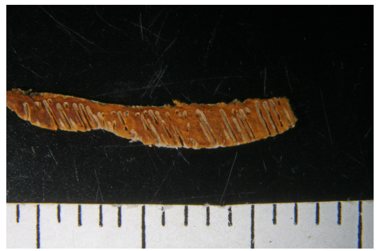
Phellinus ferreus, a cross section showing the long thin hymenial chambers which lie just beneath the pores.