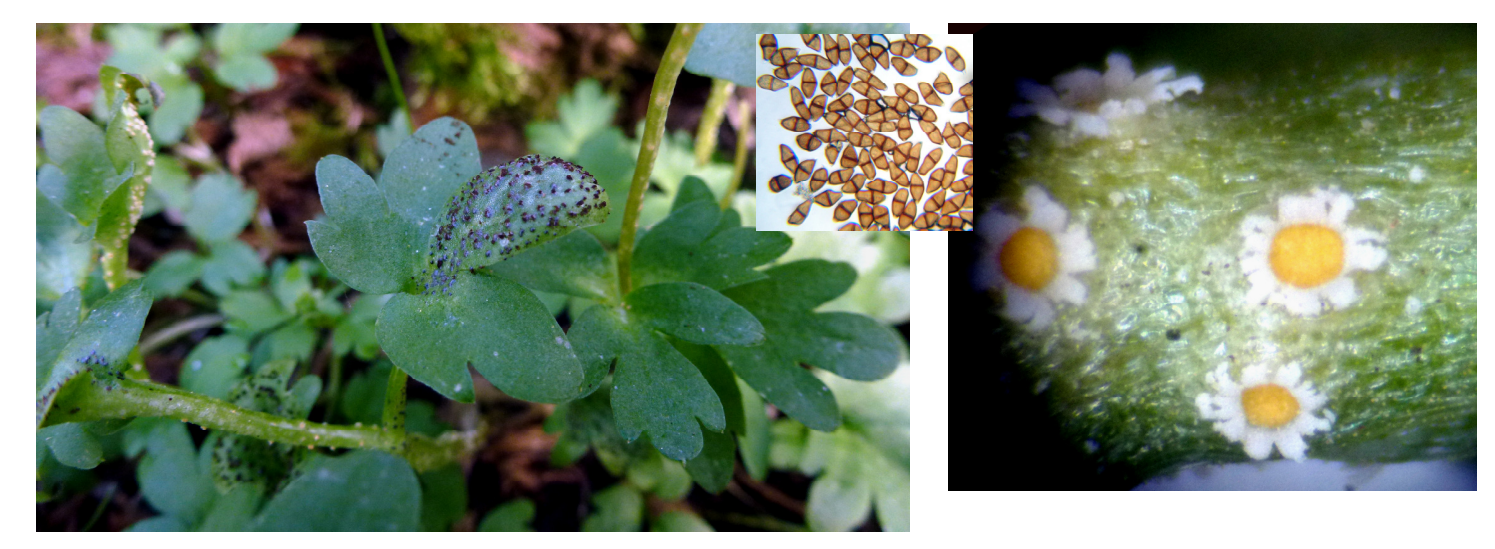
The rust Puccinia adoxae on Moschatel. The dark brown tufts containing the septate teleospores (magnified in the insert) can be seen on the leaves (above left), and the paler discs (magnified to show the daisy-like pattern above right) can be seen on the stems below (above left) (PC).

Moving on from ascos to a couple of rusts which were of interest today. John found one growing on Moschatel (or Townhall clock) which was showing two different stages; on the stems were tiny white cups with yellow centres, and on the leaves were dark brown tufts of teleospores. Rusts can be quite easy to identify compared to other groups of fungi because they tend to be host specific, thus if you can name the host plant it is often a case of looking up that plant in Ellis & Ellis's Microfungi on landplants for a list of possible species. This technique brought me quickly to Puccinia adoxae , and a quick check that the teleospores matched the diagram confirmed it.