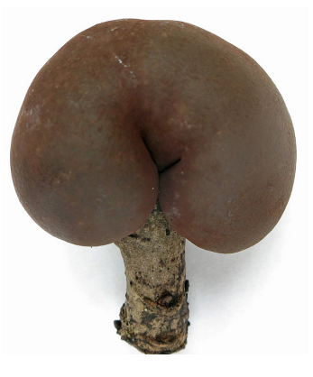
Daldinia concentrica an interesting view! (DJS)