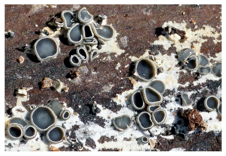
Mollisia cinerea (above - NS), Cudoniella clavus (immediately below - NS), and Lachnum niveum (below right – DJS)