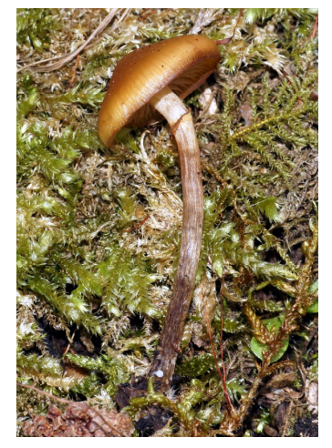
Pholiotina vexans with cap about 1.5cm across